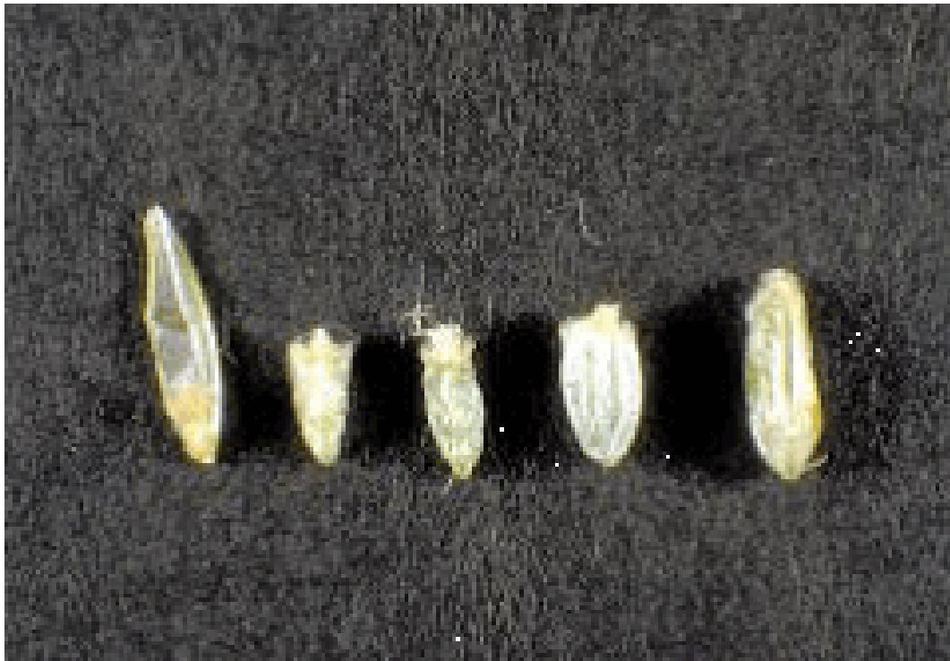
Figure 9. Kernel development stops immediately after freeze damage. Damaged kernels are grayish-white, rough and shriveled.