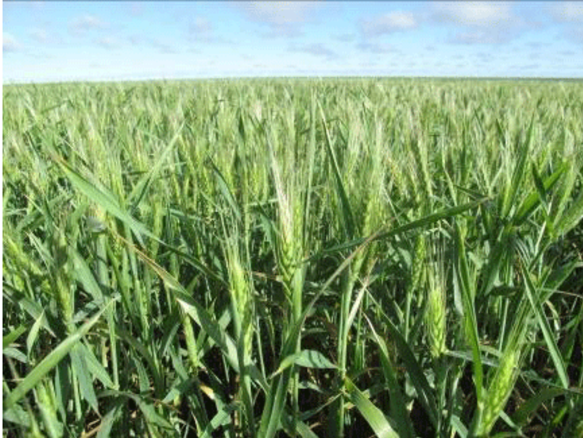
Figure 3. Freeze damage to tips of heads.

The photos below show partial white heads caused by freeze injury to wheat in the boot stage.