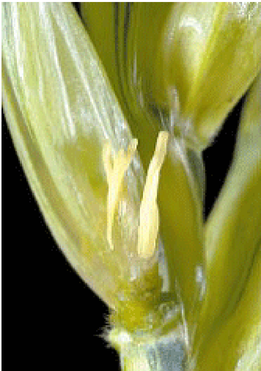
Figure 7. If damaged, anthers become white after 3 to 5 days and eventually turn whitish-