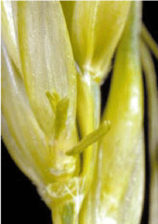
Figure 6. Anthers become twisted and shriveled, yet they are still their normal color within 24 to 48 hours after a freeze. A hand lens is necessary to detect these symptoms.