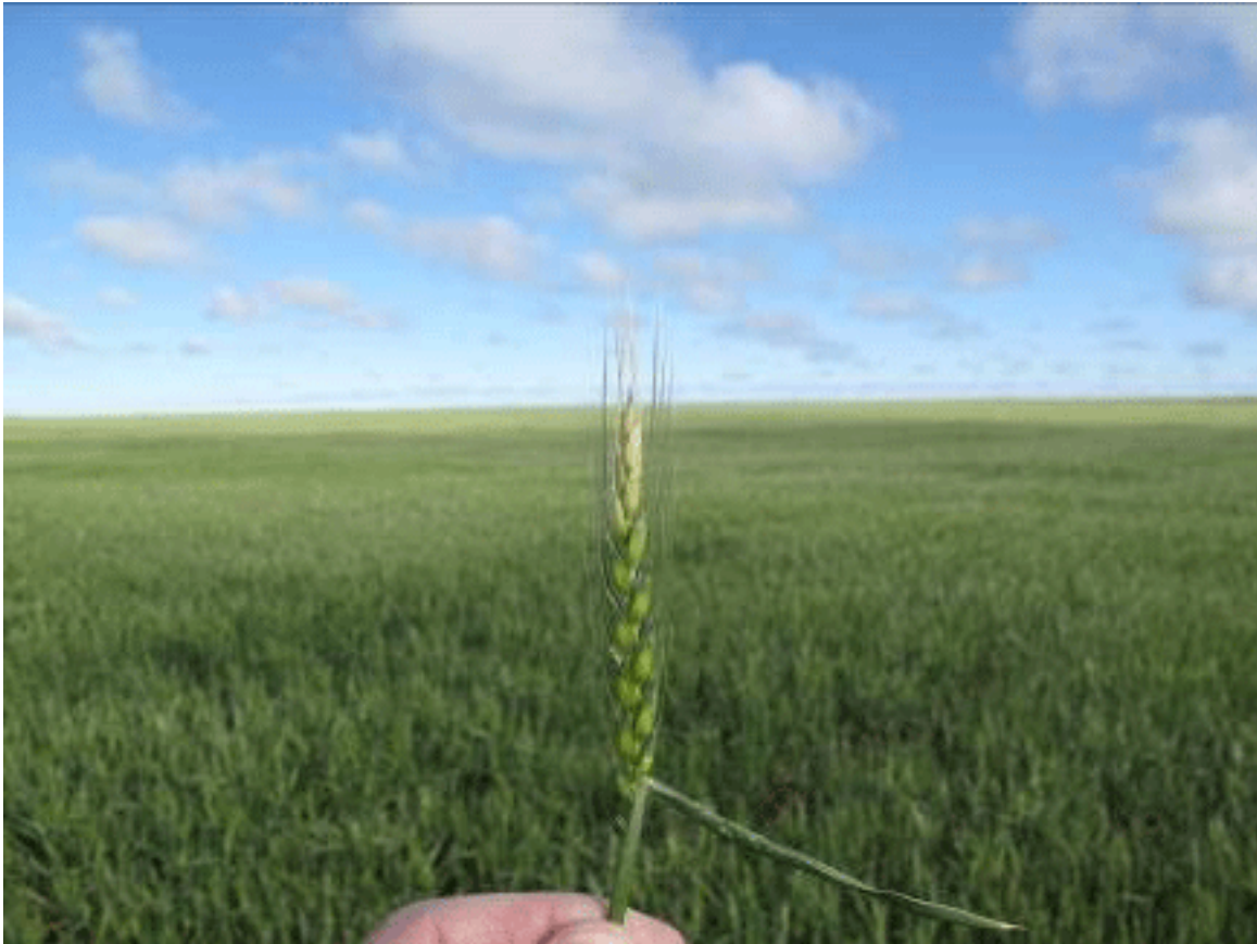
Figure 4. Closeup of freeze damage to tips of heads.

Awns beginning to appear. If the awns have begun to appear, there can be significant injury to the heads if temperatures reach about 30 degrees or lower for several hours. The heads may fully exert from the boot, but few, if any, of the spikelets may pollinate normally and fill grain. Damaged heads from a freeze at this stage of growth may seem green and firm at first glance, but the floral parts will be yellowish and mushy.