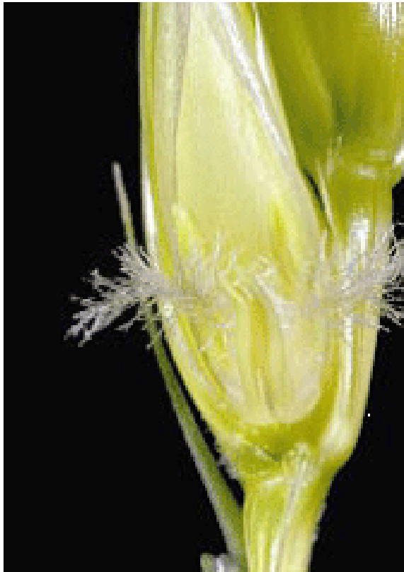
Figure 5. Healthy wheat anthers are trilobed, light green and turgid before pollen is shed. Each wheat floret contains three anthers. Healthy stigmas are white and have a feathery appearance.

at a sensitive stage when they were frozen. Grain might develop in other parts of the spikes, however, because flowering had not started or was already completed in those florets when the freeze occurred.