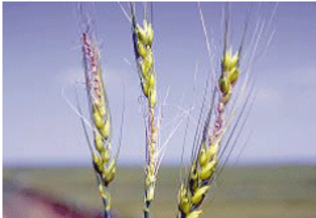
Figure 8. Damage may occur in different areas of the spike because flowering, which is the most sensitive stage to freeze, does not occur at the same time in all florets.

brown. The anthers will not shed pollen or extrude from the florets.