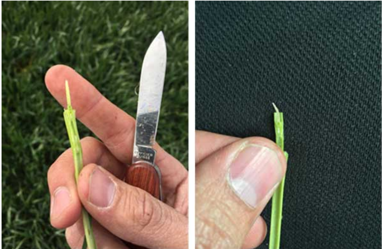
Figure 4. Following an early freeze, crops at jointing might still develop healthy heads (left panel), but depending on minimum temperatures and duration of the freeze event, the developing head might be killed even if still within the stem (right panel). The dead head is whitish and flaccid while the healthy head is light green and turgid.

The best thing producers can do for the first few days is simply walk the fields to observe lodging,