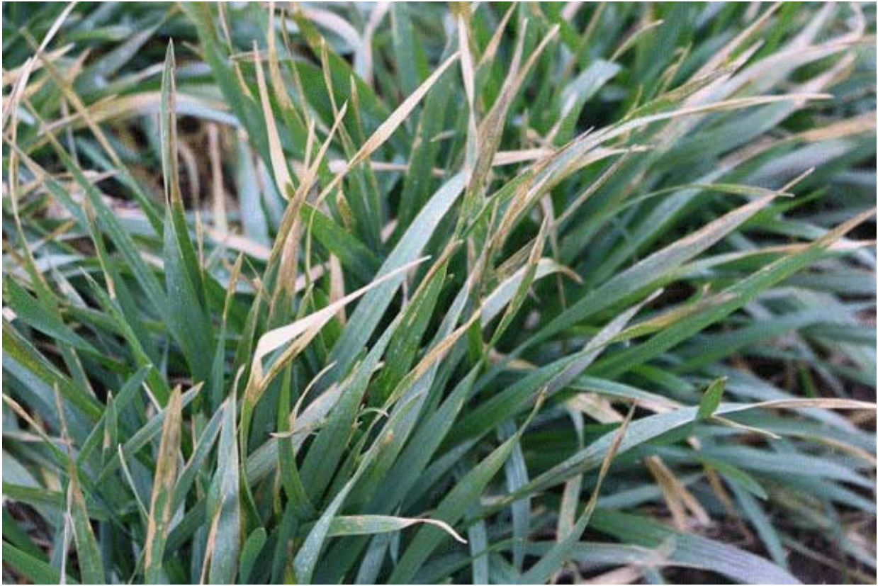
Figure 2. Leaf burn from freeze damage. By itself, this is cosmetic damage only.