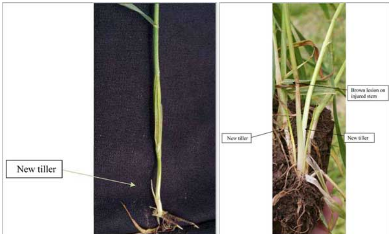
Figure 5. Left: A stem that was split open by having ice form within the stem. This stem has died and a new tiller has begun to grow at the base. Right: Some of the tillers on this plant had freeze damage to the lower stems. These stems are dying, but the symptoms may not be immediately evident. The growth of new tillers from the base of the plant is a sure sign that the main tillers are dead or dying. Note the brown lesion on the stem with the two new tillers.

If secondary tillers may begin growing normally and fill out the stand, the wheat may look ragged because the main tillers are absent. Producers should scout for bird cherry oat aphids and other potential insect or disease problems on these late-developing tillers. Enough tillers may survive to produce good yields if spring growing conditions are favorable. If both the main and secondary tillers are injured, the field may eventually have large areas that have a yellowish cast and reduced yield potential.