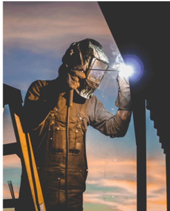
Figure 2. Hot works on Red Flag days.